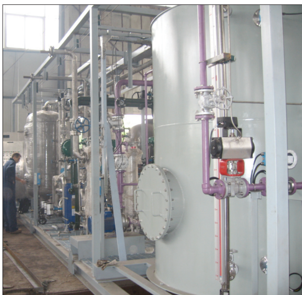
Figure 4—APU constructed for a high SO 3 /acid mist ingress