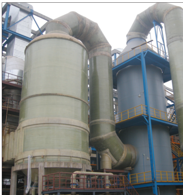
Figure 2—Cansolv SO 2 scrubber