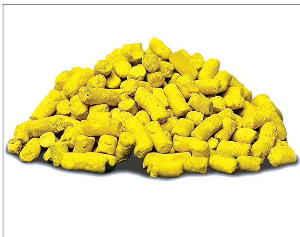
Figure 3—T pellet lines of catalysts