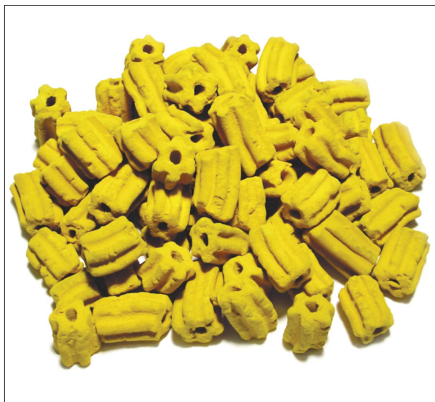
Figure 1—XLP six-lobed, ribbed-ring line of catalyst