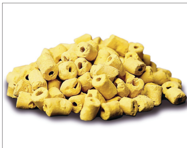
Figure 2—LP raschig-ring line of catalyst